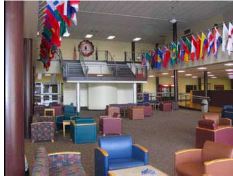
Interior of Schwitzer Student Center