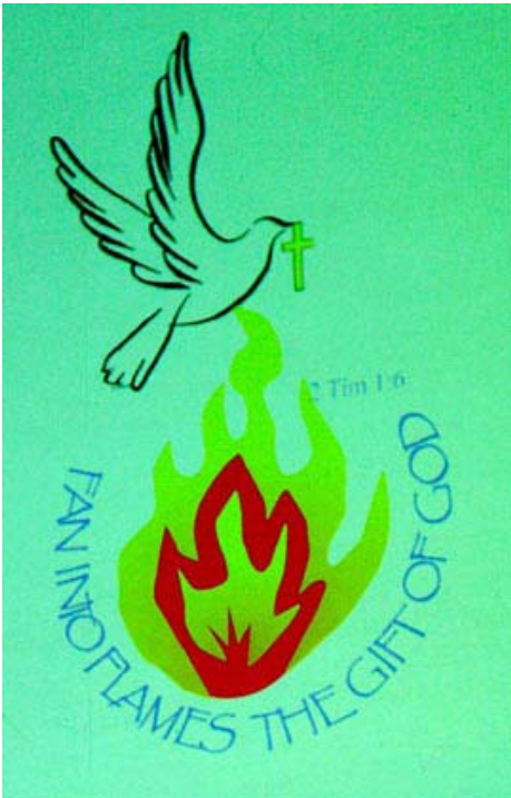
The Banner for the 2008 NLS Annual Meeting in Arizona.