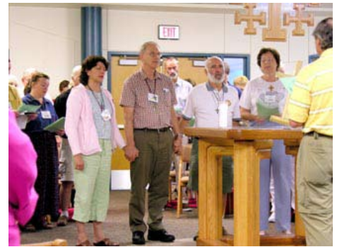
Installation of newly-elected officers

The NLS Executive Board has divided the U. S. into related regions. Iowa is