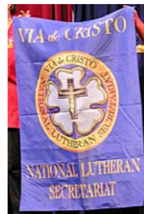
Our NLS Banner.