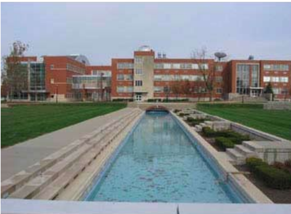
The University of Indianapolis Campus