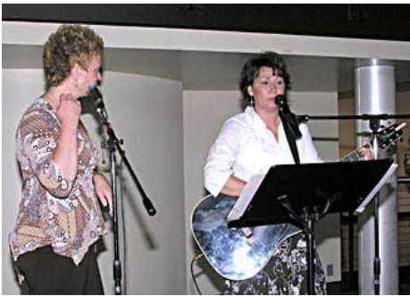
Entertainment every evening