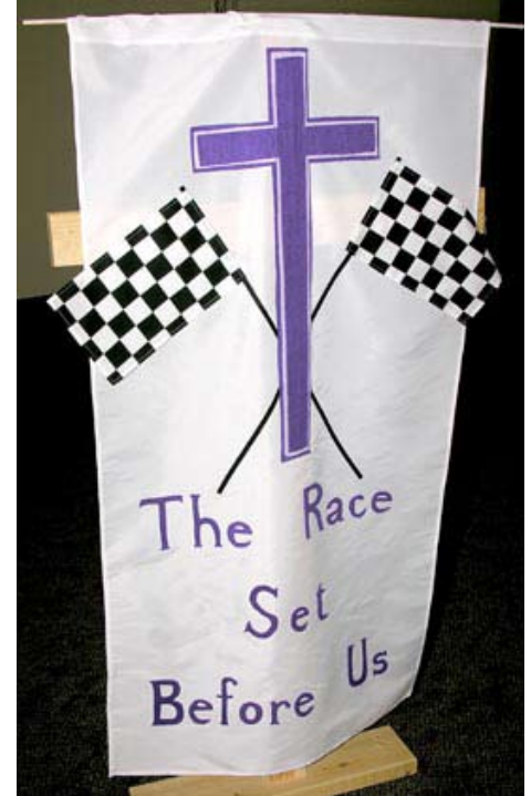
The 2007 NLS Annual Meeting banner