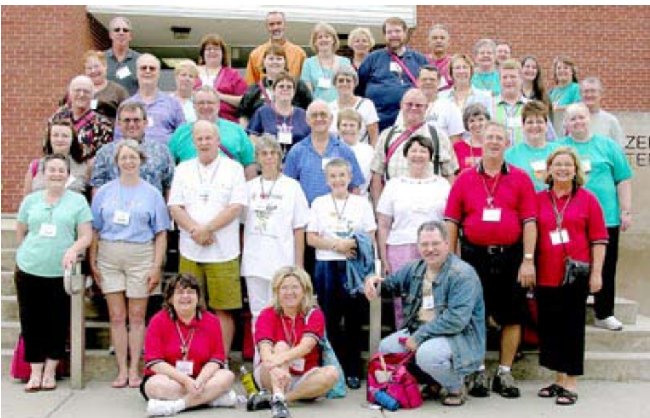
Look at all the first-timers destined to return in the future—more than forty!