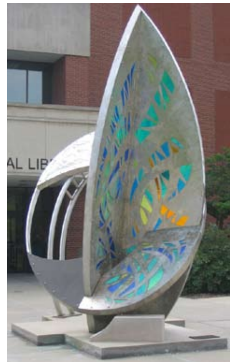
Sculpture in front of Library Auditorium