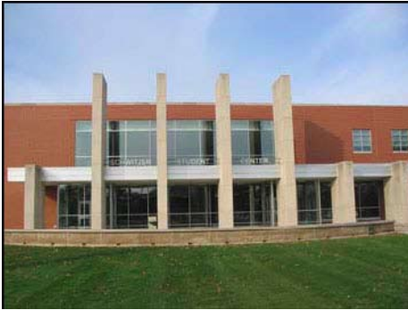
Entrance to Schwitzer Student Center