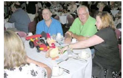
An Indy theme at every table. Race cars and INKY doll mascots (Indiana and Kentucky are together in one secretariat). We didn't race through the meals, though, they were delicious!