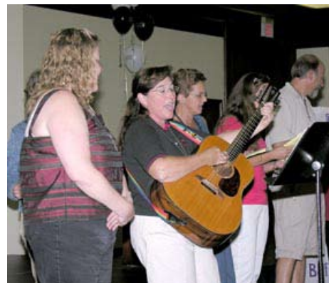
The serenaders sang their hearts out at the Saturday evening banquet.